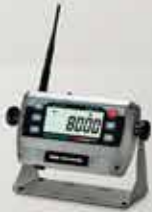
MSI-8000 HD RF Remote Display