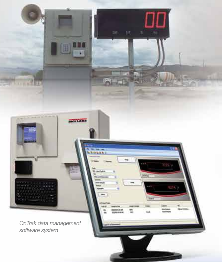
OnTrak data management software system