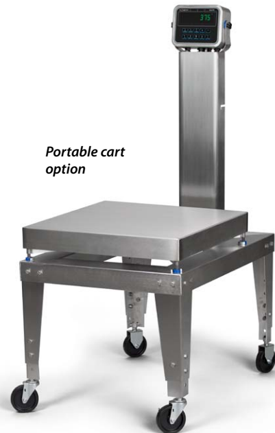
Portable cart option

Avery Weigh-Tronix - USA 1000 Armstrong Drive, Fairmont, MN 56031-1439 USA usinfo@awtxglobal.com Toll-Free: (800) 533-0456 Phone: (507) 238-4461